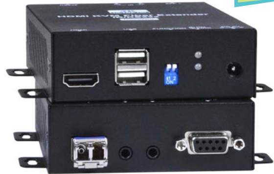
ST-FOUSB4K18GB-LC (Remote and Local Units)