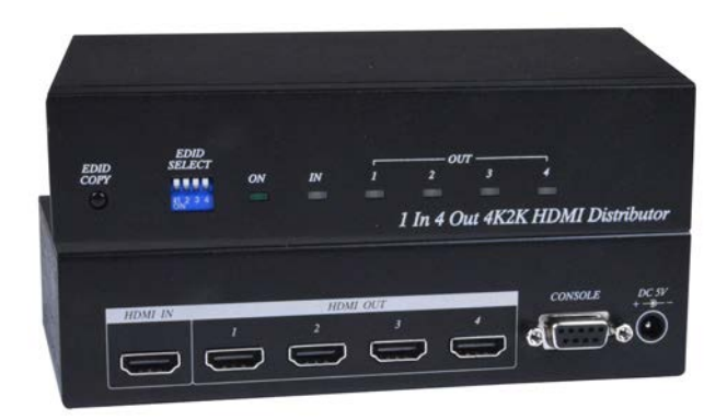
VOPEX-4K18GB-4 (Front & Back)