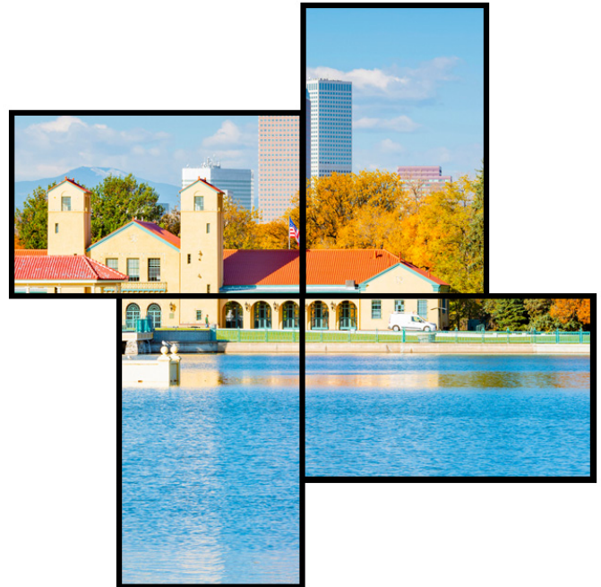
Custom Video Wall Design