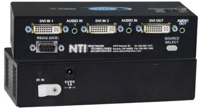
VIDMUX® SE-DVI-2ARS (Front & Back)

The VIDMUX® DVI/HDMI video/audio switch enables one DVI/HDMI display and speakers to be switched between two single link digital DVI/HDMI video sources.